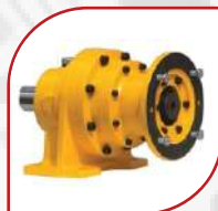
Foot Mounted Planetary Gearbox