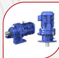
Drive Gear Motor, Reducer