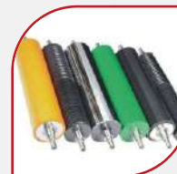
All Types of Rollers

Balancing facility available by authorised vendor