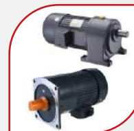
Medium Gear Motor (AC-DC)