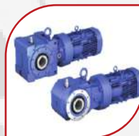
Bevel Buddy Box